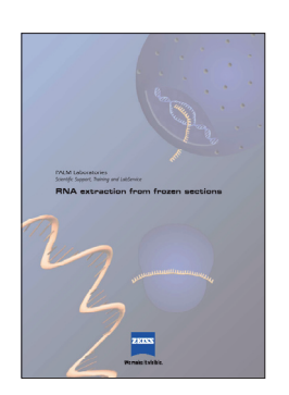
Short Protocol RNA extraction from frozen sections